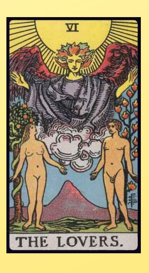
Relationships, Harmony, Male/Female Energy