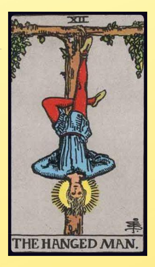
Surrender, Pause, Shifting Perspective, Spiritual Insight