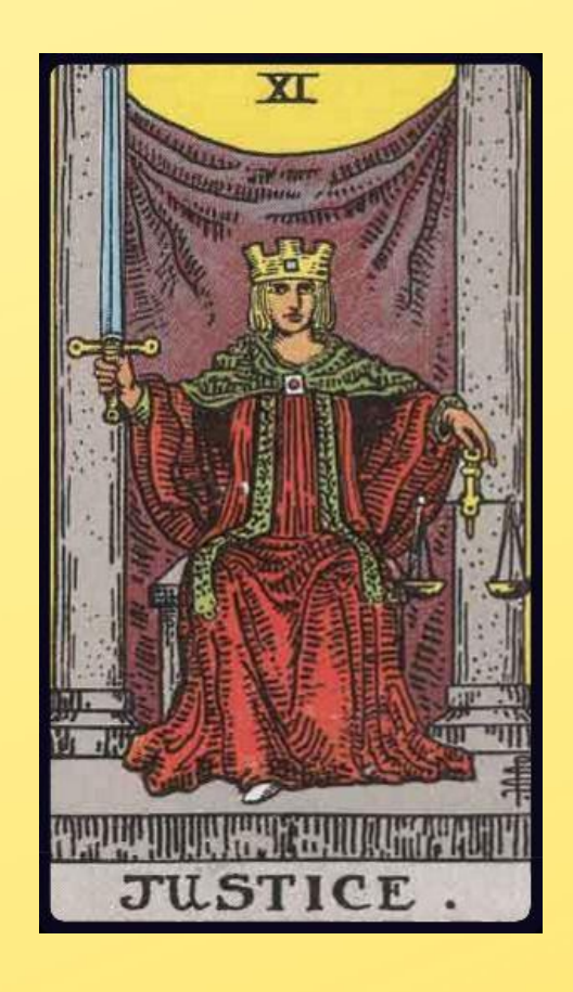
Logic, Truth, Fairness, Balance