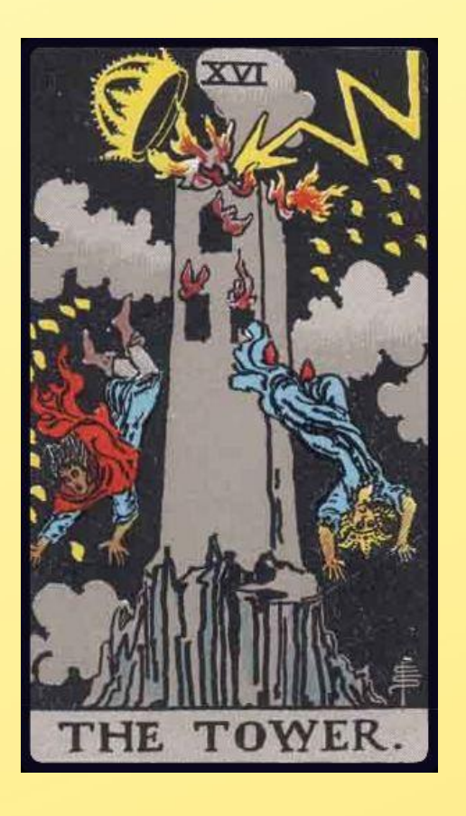
Upheaval, Catastrophic Change, Breakthrough