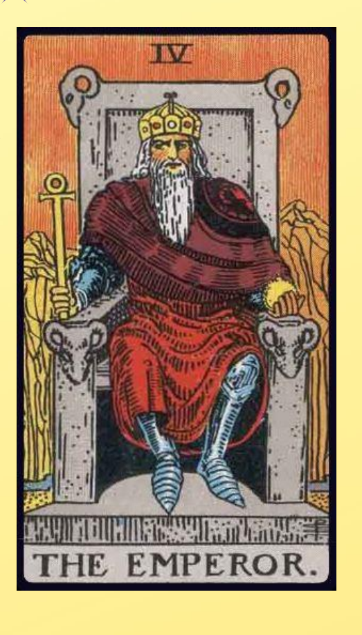
Power, Intuition, Masculine Energy, Action