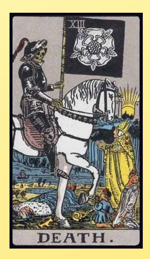
Radical Transformation, Grief, Rebirth, Moving On