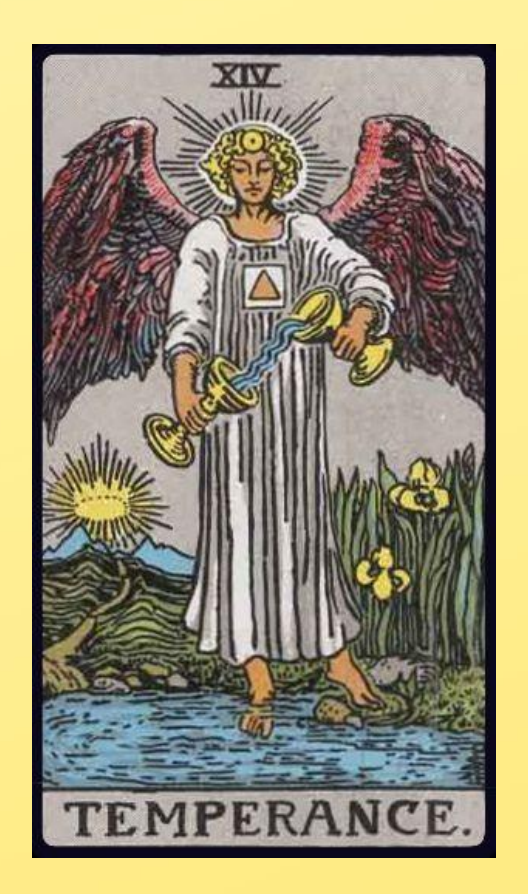
Patience, Moderation, Trust Divine Power