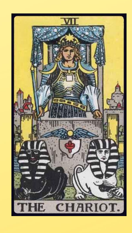
Momentum, Goals, Action