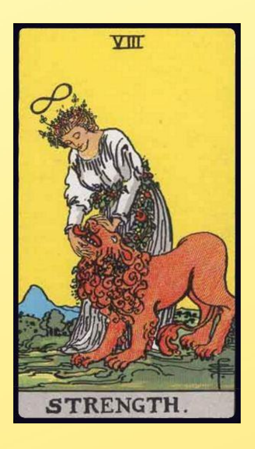
Endurance, Quiet Power, Facing Fears