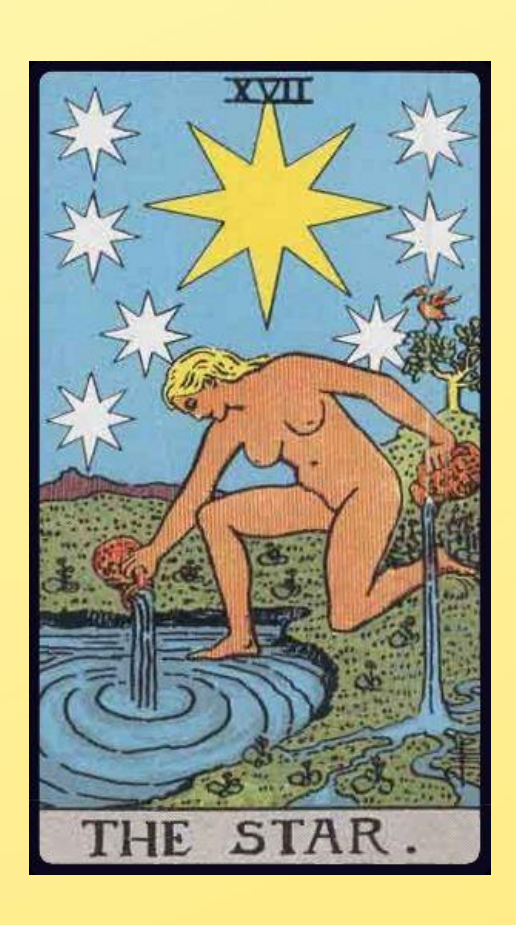
Healing, Inspiration, Renewal of Faith