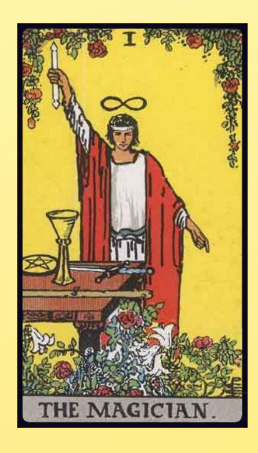
Manifestation, Creation, Spiritual Gifts Note: All 4 Elements Present