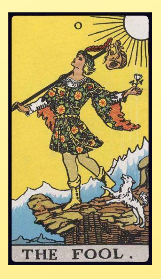
Blind Optimism, Hope, Faith Youth, Naivete