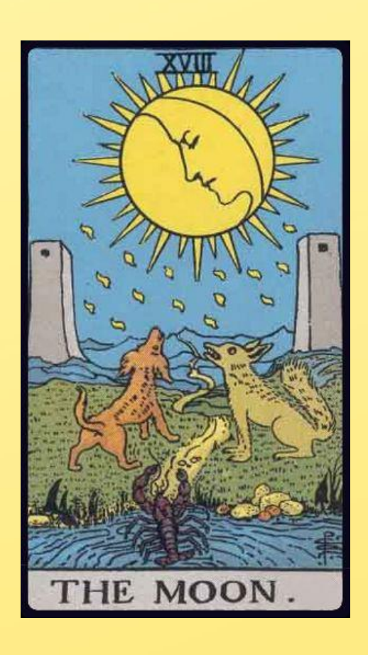
Shadow Self, Illusion, Dreams, The Subconscious