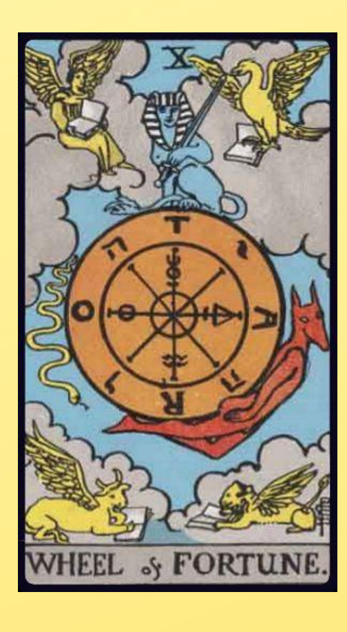
Cycles of Life, Invisible Forces, Divine Connection