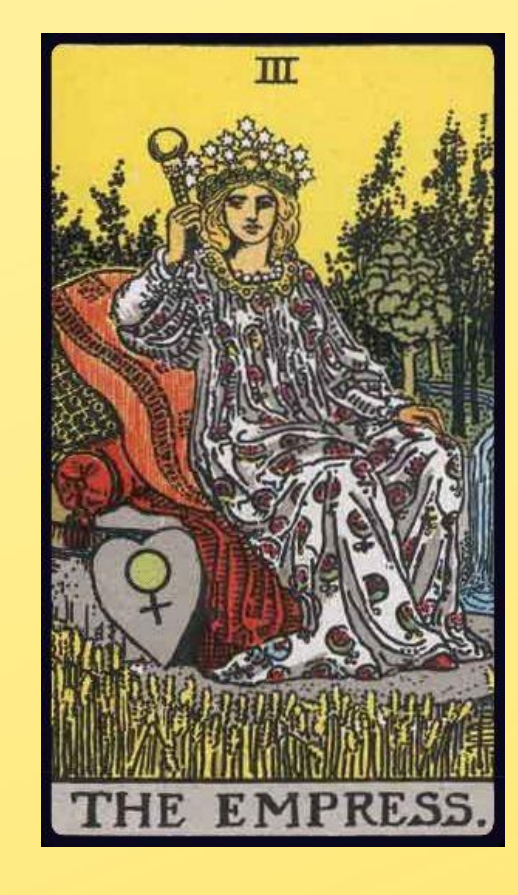
Receiving Love, Fertility, Attraction