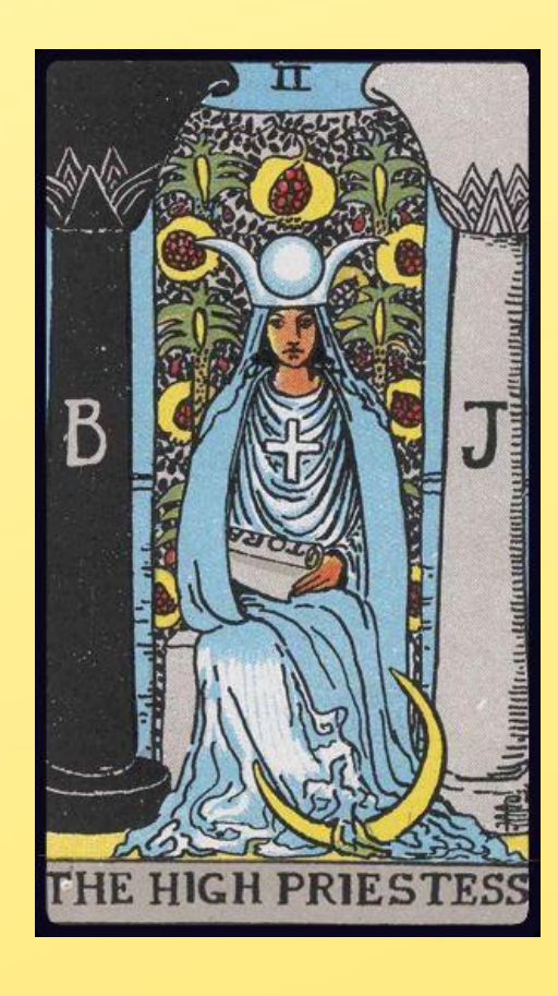
Duality, Intuition, Inner Wisdom