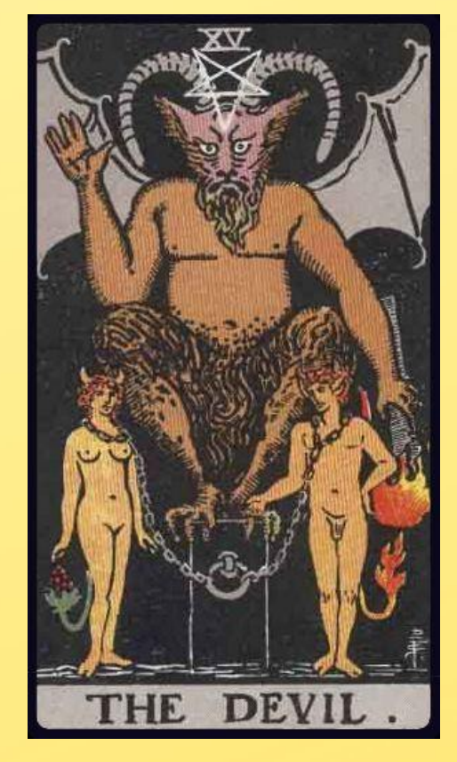
Addiction, Negative Patterns, Self Sabotage